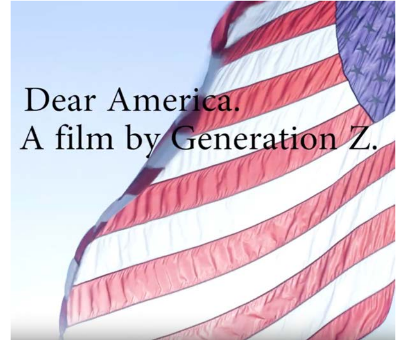
Molly Smith + Sage Croft Youth Free Expression Film Contest Winners