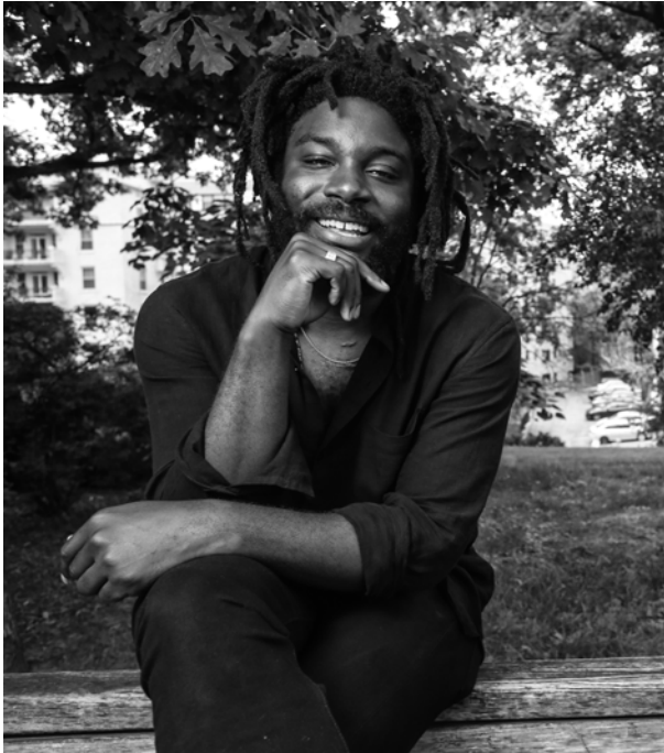
Jason Reynolds Award-Winning Author